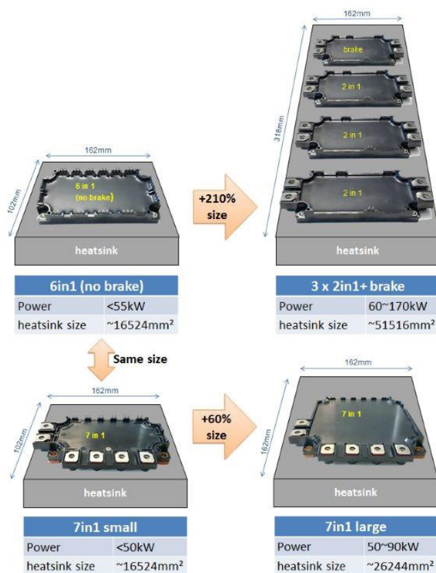
Figure 4: Heatsink size and inverter power comparison

Therefore the 7in1 modules offer an optimized solution to design a scalable cost effective motor drive inverter.